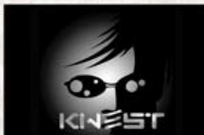
KWest- 705 Duval St.