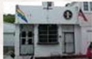
One Saloon- 514 Petronia St.