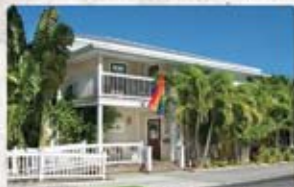
Island House- 1129 Flemingl St.