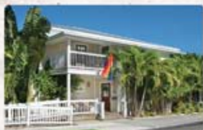
Island House- 1129 Flemingl St.