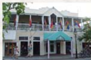
Bourbon- 724 Duval St.