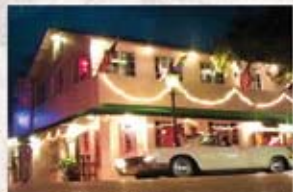
801- 801 Duval St.