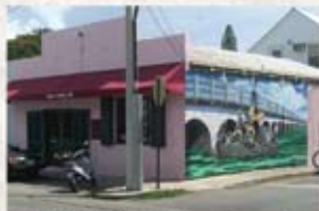
Bobby's- 900 Simonton St.