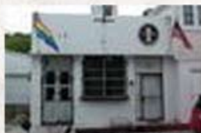
One Saloon- 514 Petronia St.