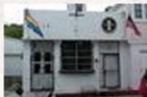
One Saloon- 514 Petronia St.