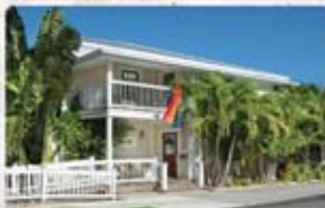
Island House- 1129 Fleming St.