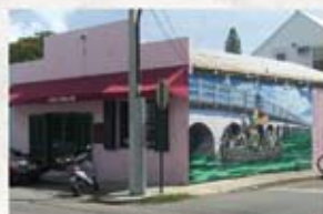
Bobby's- 900 Simonton St.