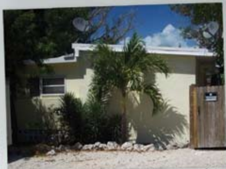
9 Ventana Lane, Big Coppitt $240,000