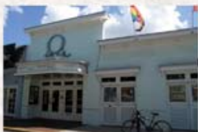
Aqua- 711 Duval St.