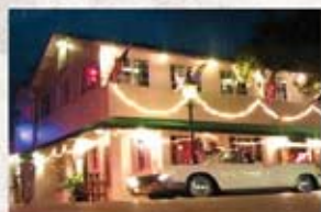
801- 801 Duval St.