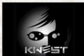
KWest- 705 Duval St.