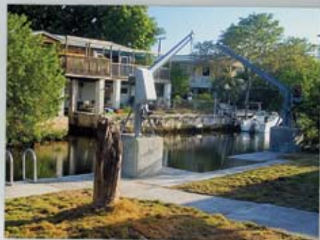
Seawall & Davits