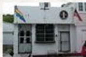
One Saloon- 514 Petronia St.