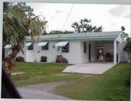
29050 Palm Ave. Big Pine Key 2 Bed / 1 Bath - Only $349,900