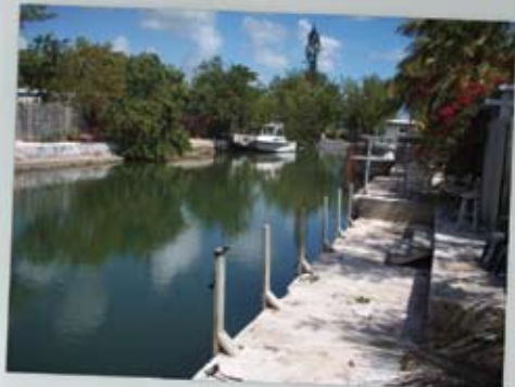
2 Beds / 2 Baths Waterfront Home