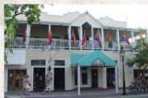
Bourbon- 724 Duval St.