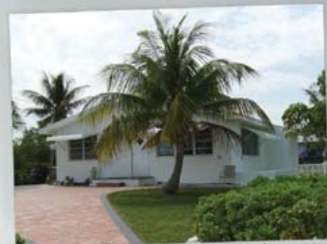
31253 Hibiscus Dr, Big Pine Key $1,100,000