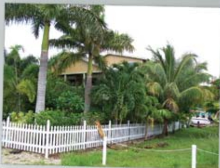
3931 Gordon Road, Big Pine Key $440,000