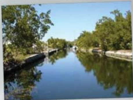
3 Beds / 2 Baths Bogie Channel Access