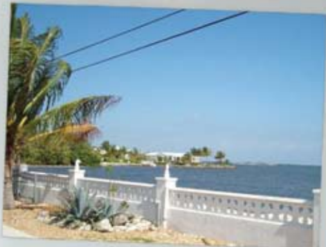
4 Beds / 1 1/2 Baths 125 foot concrete seawall