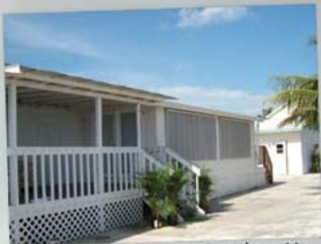
31360 Avenue J, Big Pine Key $799,000