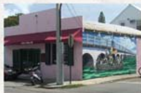
Bobby's- 900 Simonton St.