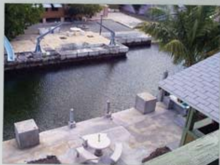
Concrete Seawall Boat Ramp & Davit Pads