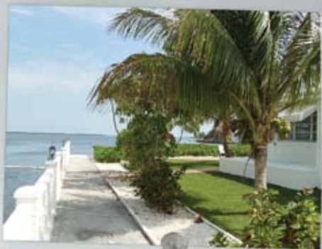
3 Beds / 2 Baths Dockage with Boat Basin