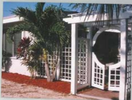
1576 Bogie Drive, Big Pine Key $575,000