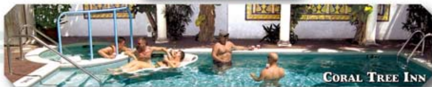
CORAL TREE INN