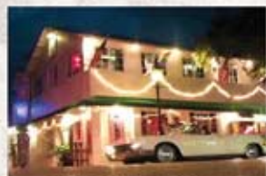
801- 801 Duval St.

Karaoke starting at 6 PM American Idol starting at 8 PM Dancers on the bar starting at 10 PM