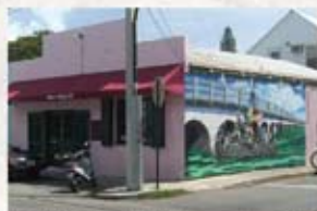
Bobby's- 900 Simonton St.