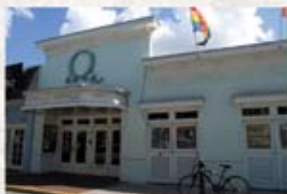
Aqua- 711 Duval St.