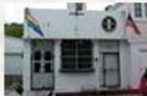
One Saloon- 514 Petronia St.