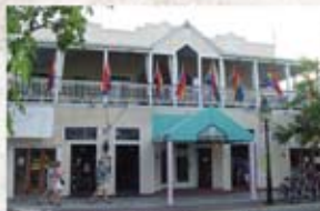
Bourbon- 724 Duval St.