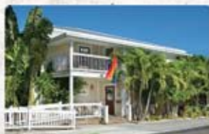
Island House- 1129 Flemingl St.