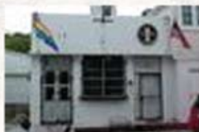
One Saloon- 514 Petronia St.