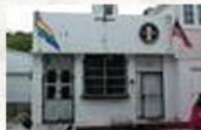
One Saloon- 514 Petronia St.