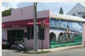
Bobby's- 900 Simonton St.