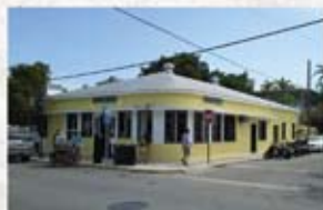
Key West Pub- 1114 Duval