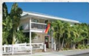
Island House- 1129 Fleming