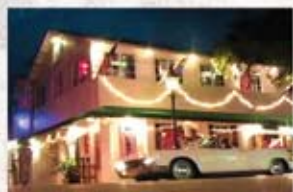
801- 801 Duval St.