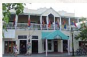
Bourbon- 724 Duval St.